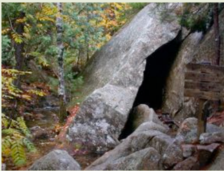
Fig 9. Rock tunnel on Giant Slide trail

century ships moored to obtain fresh water from the stream that cascades into the ocean there, followed by a gentle return walk. Park at the Acadia mountain lot on Rte 102. The route is the Acadia mountain trail → return on fire road (Man O'War Brook Valley) or, for a longer hike, East Face Trail of St Sauveur mountain → St Sauveur Cliffs (go all the way to Valley Peak) → retrace steps to St Sauveur Peak → Trail back to Acadia parking lot. The shorter route is about 2 miles.