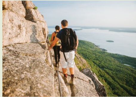
Fig. 6. View of Frenchman's Bay from Precipice trail

to the top the short detour to The Bowl (a small glacial lake) is definitely worthwhile, and I am a big proponent of also hiking Gorham mountain, which isn't hard and has great views (Fig. 4). The return trip along the Ocean Trail is also beautiful (Fig.