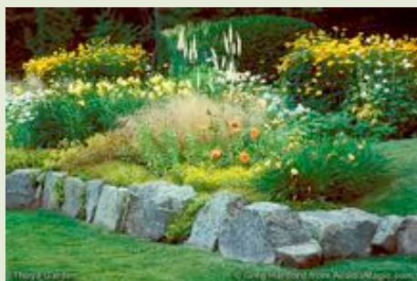
Fig. 24. Flowers at the lovely Thuya Garden

The outfitters above and others offer rock-climbing lessons. Acadia Mountain Guides Climbing School (198 Main St, Bar Harbor, 288-8186 or 1-888-232-9559) is good. Also Atlantic Climbing School (26 Cottage St, Bar Harbor, 288-2521). Kids love this. They teach you how to rappel down cliffs and climb up them, using ropes. Beginner lessons are often at Otter Cliffs (Fig. 23), the highest cliffs on