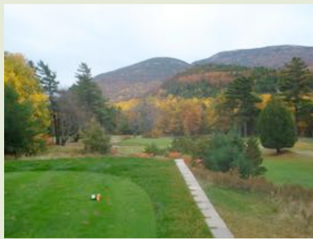
Fig. 28. Kebo Valley golf course

You can take glider rides (207-667-SOAR) and sightseeing airplane rides (207-667-6527) out of Trenton Airport.