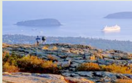
Fig 10. Cadillac Mtn summit

Relatively young children can scramble up the back side of the South Bubble, as noted above, but there are three other relatively short out-and-back hikes that our young grandchildren enjoy.