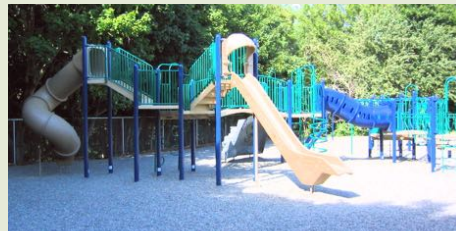
Fig. 31. Emerson School playground

Mt Desert St in Bar Harbor and especially in Blue Hill, ME, which is a beautiful town in its own right. If you go to Blue Hill don't forget to travel south of town to the Blue Hill Reversing Falls on Rte 175.