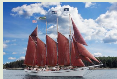
Fig. 26. The schooner Margaret Todd

Several cruises out of Bar Harbor at about noon daily to whaling spots in the Gulf of Maine. (Bar Harbor Whale Watch Co., 288-2386 for tickets. www.barharborwhales.com/default.php ) Some companies also show you puffins (Fig. 25) (e.g., Sea Bird Watcher, 800-BIRDS-94) or seals. You are virtually guaranteed to see lots of humpback whales. Remember to