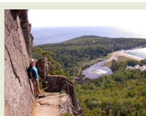
Fig. 1. View of Sand Beach from part way up Beehive trail

Park at Sand Beach on the Park Loop Road. Do this hike early in the day before the crowds arrive. It is very popular. The trail starts across the road. The route is Beehive → The Bowl → Halfway mountain → Gorham mountain (Cadillac Cliffs side trail) → Ocean trail back to the parking lot. Exciting climbing (up!) on Beehive, beautiful views from Beehive and Gorham, beautiful, easy walk back along classic Maine coast. This route is the most scenery for the