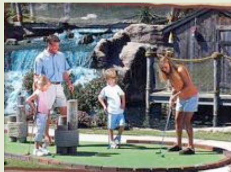
Fig. 29. Pirate's Cove Miniature Golf

Pirate's Cove Adventure Golf (Fig. 29) on Rte 3 between the entrance to