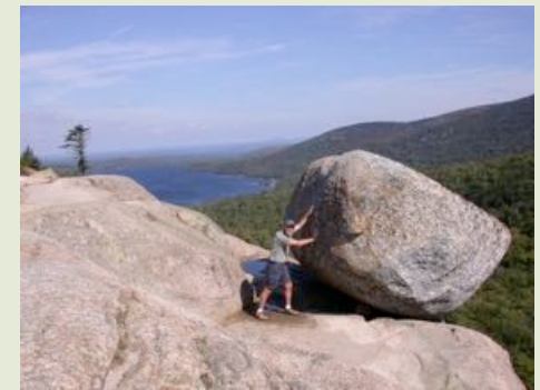
Fig. 8. Bubble Rock on top of the South Bubble mountain

Penobscot mountain (Jordan Ridge trail). About 5 miles.