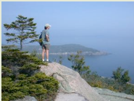
Fig. 4. View from Gorham mountain trail