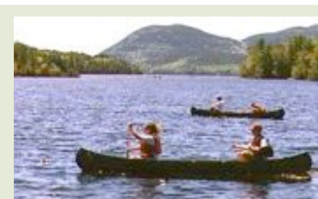
Fig. 16. Canoeing on Long Pond

For real ocean swimming for the hardy (and well insulated) we recommend Sand Beach in the National Park (especially) or the beach at Seal Harbor (both with water temp usually in lower 60s!). For freshwater swimming (much warmer, where locals swim) go to Echo Lake (Fig. 15) or Long Pond. Both have gorgeous views and Echo Lake has a very nice, big beach and a lifeguard. Long Pond has a floating raft in deeper water for diving. Both are best on really hot days. Echo Lake beach is at the southern end of the lake. It is reached via a signed Natl Park road off Route 102 on the way to Southwest Harbor.