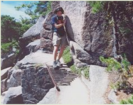
Fig. 3. Grate over small crevasse on Beehive trail