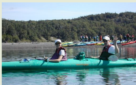
Fig. 17. Sea kayaks are large and stable

Long Pond (Fig. 16) (embark canoes and kayaks at National Park Canoe Center on Pretty Marsh Rd), Echo Lake (embark at Ike's Point off Route 102 to Southwest Harbor and Eagle Lake (embark just off Rte 233/Eagle Lake Rd) are all great and beautiful spots for canoeing. You can rent canoes, kayaks (and car carriers) at the National Park Canoe Center or at any of the outfitters in Bar Harbor (e.g., Acadia Bike and Canoe, 48 Cottage St, 288-9605).