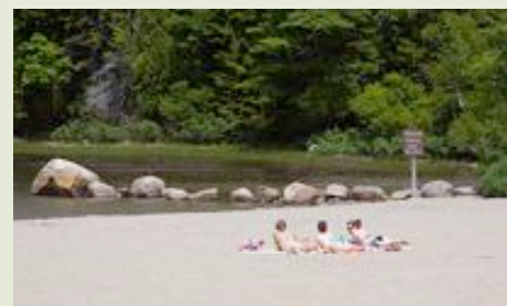
Fig. 15. Echo Lake beach

Park at Parkman mountain lot on Rte 198 or at Jordan Pond House. From Parkman the signposts are: Parking → 13 (go left) → 12 (go left) → 10 → 14 → 21 → 20 → 19 → 12 → 13 → Parking. Long (11.1 miles), challenging, great views, waterfall, level stretches, lakeside, has everything but you have to be in good shape .