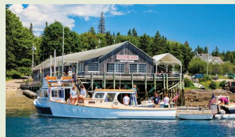
Fig. 27. Islesford Dock Restaurant on Little Cranberry Island

There are ferryboat rides to other parts of Acadia Natl Park (e.g., to the isolated Isle du Haut from Stonington, ME aboard the mail boat, 207-367-5193). One can take the early evening ferry from Northeast Harbor to Little Cranberry Island (244-5582) and eat lobster at the Islesford Dock Restaurant (Fig. 27; 244-7494) then come home on the sunset ferry. Or the beautiful Sunset Cruise on the Islesford Ferry from Northeast Harbor (276-3717). The Lunchtime (11 am