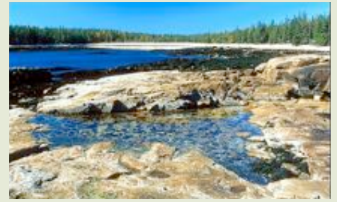
Fig. 11. Wonderland Trail end

These and many other hikes are fully described in a book called A Walk in