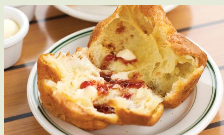
Fig. 19. Popovers at Jordan Pond House

Everyone should drive the 22 mile Park Loop Road through the National Park (Fig. 18). It is spectacular. Stop at Otter Cliffs (ignore Thunder Hole except on days with huge waves), and drive to the top of Cadillac Mtn (esp. on a sunny, clear, dry day or at sunset). A stop at the Jordan Pond Restaurant (276-3316) for their famous hot popovers (Fig. 19), tea and