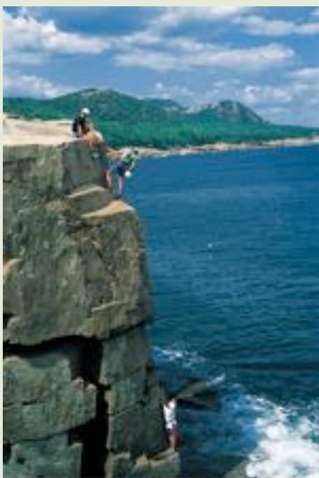
Fig. 23. Climbers rappelling on Otter Cliffs