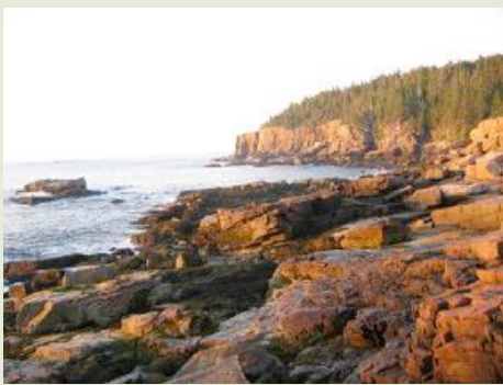
Fig. 5. Classic Maine coast along the Ocean Trail

to the top the short detour to The Bowl (a small glacial lake) is definitely worthwhile, and I am a big proponent of also hiking Gorham mountain, which isn't hard and has great views (Fig. 4). The return trip along the Ocean Trail is also beautiful (Fig.