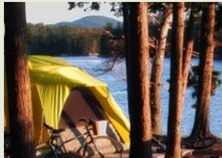
Fig. 36. Mount Desert Island Campground

Mount Desert Island hosts a dozen-plus campgrounds and more than 1,200 sites.