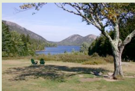
Fig. 20. View from Jordan Pond restaurant across Jordan Pond to the Bubbles