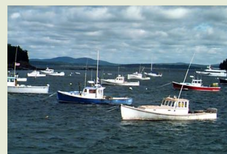
Fig. 22. Lobster boats in Manset harbor

real lemonade is also recommended, as noted above, but it is often VERY crowded. Come at off hours (mid-morning or mid-after-noon). The view from the lawn (Fig. 20) is outstanding. I prefer to drive the Park Road early in the morning before traffic picks up. It's also magical on a foggy morning, though the views are less grand. Another must drive is Sargent Drive along Somes Sound, going toward Northeast Harbor. The ultra wealthy live in Northeast Harbor and Seal Harbor (Martha Stewart, the Rockefellers, the Fords, etc.). The homes from Sargent Drive around to Seal Harbor are gorgeous—esp. the ones on the roads winding up the hill behind Seal Harbor. Bass Harbor Light (Fig. 21) is famous and pretty and worth seeing if you are down at that end of the island (e.g., to eat at Thurston's Lobster Pound). The harbor at Manset (Fig. 22) is also very pretty and prototypical New England.