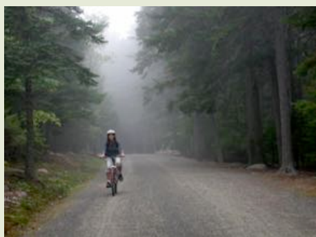
Fig. 12. There are more than 50 miles of carriage trails, which are now used for biking