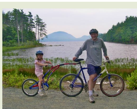
Fig. 13. One of many beautiful vistas along the carriage trails