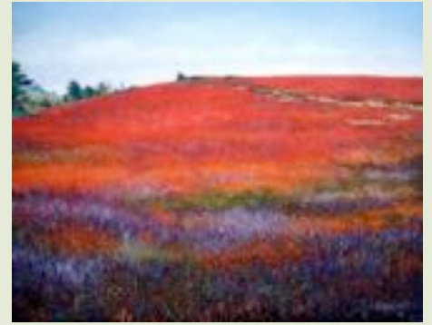
Fig. 32. Blueberry Barrens in September

Maine is the world's largest producer of wild blueberries. These "low bush" berries are smaller and much tastier than cultivated blueberries and are not to be missed. They are available in most local grocery stores once they come in season in August.