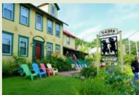
Fig. 33. Two Cats Inn & Cafe