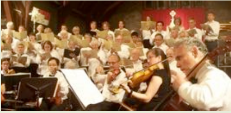
Fig. 30. Mount Desert Summer Chorale

year on the first Friday and Saturday in August. I sing with this group. 2019 is their 51st anniversary concert (Carl Orff's Carmina Burana)