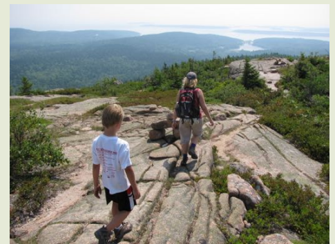
Fig. 7. Open views and easy descent along Jordan Ridge Trail

Park at the Jordan Pond restaurant off the Park Loop Road. The route is Jordan Cliffs → Penobscot mountain summit → Jordan Ridge trail. Difficult, exciting first half on the Jordan Cliffs trail, comparable to Beehive or Precipice, with narrow ridges, log bridges over crevasses and iron rung ladders and handholds. Easy descent with super 270 degree views (Fig. 7) along the rocky, open south ridge of