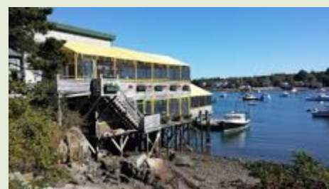
Fig. 34. Thurston's Lobster Pound

Abel's Lobster Pound (13 Abel's Lane — road to Northeast Harbor from Somesville, on the right just beyond Bar Harbor turn off; 276-5827).