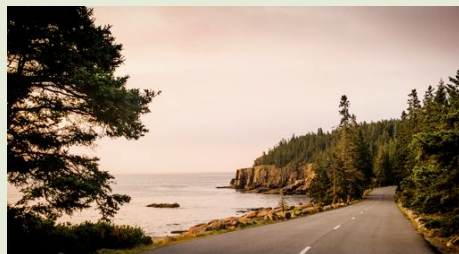
Fig. 18. Park Loop Road at sunrise

288-0007, Acadia Park Sea Kayak Tours, 244-0577 and National Park Sea Kayak Tours, 288-3205).