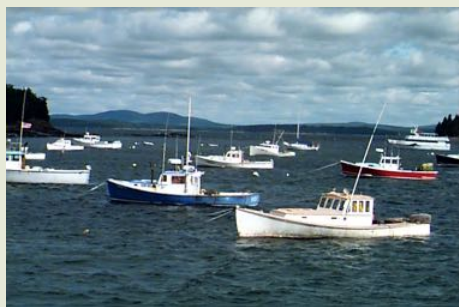
Fig. 21. Lobster boats in Manset harbor

Thurston's Lobster Pound). The harbor at Manset (Fig. 21) is also very pretty and prototypical New England.