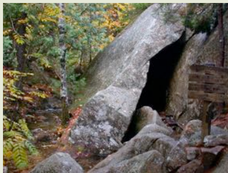
Fig 9. Rock tunnel on Giant Slide trail

on fire road (Man O'War Brook Valley) or, for a longer hike, East Face Trail of St Sauveur mountain → St Sauveur Cliffs (go all the way to Valley Peak) → retrace steps to St Sauveur Peak → Trail back to Acadia