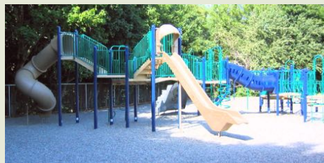
Fig. 27. Emerson School playground

There are children's playgrounds in Bar Harbor (across from the YMCA) and in Southwest Harbor, but our grandchildren's favorite is behind Emerson Elementary School (Fig. 27). The school is located at the corner where Route 233 (Eagle Lake Road) meets Route 3 (Mt Desert St) in Bar Harbor. Great slides and tire swing.