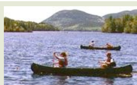
Fig. 16. Canoeing on Long Pond

Long Pond (Fig. 16) (embark canoes and kayaks at National Park Canoe Center on Pretty Marsh Rd), Echo Lake (embark at Ike's Point off Route 102 to Southwest Harbor and Eagle