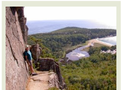
Fig. 1. View of Sand Beach from part way up Beehive trail

Park at Sand Beach on the Park Loop Road. Do this hike early in the day before the crowds arrive. It is very popular . The trail starts across the road. The route is Beehive → The Bowl → Halfway mountain → Gorham mountain (Cadillac Cliffs side trail) → Ocean trail back to the parking lot. Exciting climbing (up!) on Beehive, beautiful views from Beehive and Gorham, beautiful, easy walk back along classic Maine coast. This route is the most scenery for the least work. About 4-5 miles. Beehive