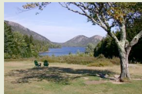
Fig. 19. View from Jordan Pond restaurant across Jordan Pond to the Bubbles

drive to the top of Cadillac Mtn (esp. on a sunny, clear, dry day or at sunset). A stop at the Jordan Pond Restaurant (276-3316) for their famous hot popovers, tea and real lemonade is also recommended, as noted above, but it is often VERY crowded. Come at off hours (mid-morning or mid-after-noon). The view from the lawn (Fig. 19) is outstanding. I prefer to drive the Park Road early in the morning before traffic picks up. It's also magical on a foggy morning, though the views are less grand. Another must drive is Sargent Drive along Somes Sound, going toward Northeast Harbor. The ultra wealthy live in Northeast Harbor and Seal Harbor (Martha Stewart, the Rockefeller, the Fords, etc.). The homes from Sargent Drive around to Seal Harbor are gorgeous—esp. the ones on the roads winding up the hill behind Seal Harbor. Bass Harbor Light (Fig. 20) is famous and pretty and worth seeing if you are down at that end of the island (e.g., to eat at