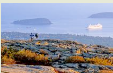
Fig 10. Cadillac Mtn summit

Relatively young children can scramble up the back side of the South Bubble, as noted above, but there are three other relatively short out-and-back hikes that our young grandchildren enjoy.