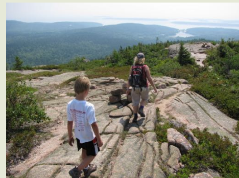
Fig. 7. Open views and easy descent along Jordan Ridge Trail

Park at Bubbles parking on the Park Loop Road. The route is Jordan Carry