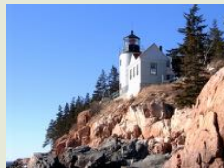
Fig. 20. Bass Harbor Lighthouse