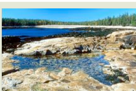
Fig. 11. Wonderland Trail end

This flat (1.4 mi roundtrip) trail begins off Rte 102A at the very southern end of the western side of the island. The wooded trail ends at a beautiful ocean cove with wonderful rocks and tide pools for kids to explore (Fig. 11).