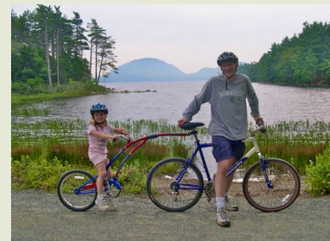
Fig. 13. One of many beautiful vistas along the carriage trails

Two good books describing the carriage roads and biking trails are Biking on Mount Desert Island (A Pocket Guide) by Audrey Minutolo (Down East Books); and A Pocket Guide to Carriage Roads of Acadia National Park (Pocket Guide) by Diana Abrell (Down East Books).