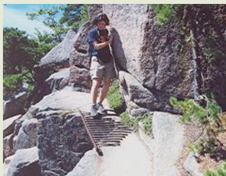
Fig. 3. Grate over small crevasse on Beehive trail