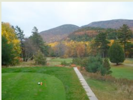
Fig. 25. Kebo Valley golf course

You can take glider rides (207-667-SOAR) and sightseeing airplane rides (207-667-6527) out of Trenton Airport.