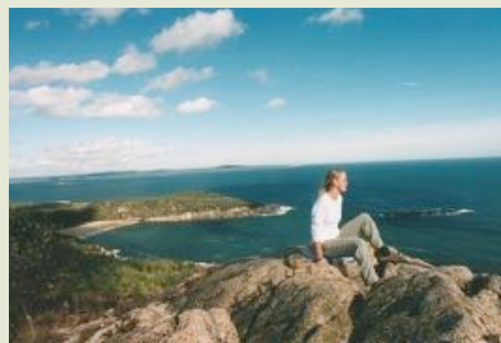
Fig. 6. View of Frenchman's Bay from top of Precipice trail

small glacial lake) is definitely worthwhile, and I am a big proponent of also hiking Gorham mountain, which isn't hard and has great views (Fig. 4). The return trip along the Ocean Trail is also beautiful (Fig. 5).