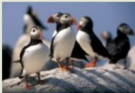
Fig. 23. Puffins

hp ) Some companies also show you puffins (Fig. 23) (e.g., Sea Bird Watcher, 800-BIRDS-94) or seals. You are virtually guaranteed to see lots of humpback whales. Remember to bring warm jackets and maybe even gloves. It's always cold out in the Gulf of Maine, even on the hottest day (sea temp only in 50's).