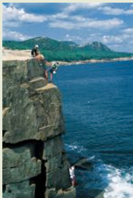
Fig. 18. Climbers rappelling on Otter Cliffs

The outfitters above and others offer rock-climbing lessons. Acadia Mountain Guides Climbing School (198 Main St, Bar Harbor, 288-8186 or 1-888-232-9559) is good. Also Atlantic Climbing School (26 Cottage St, Bar Harbor, 288-2521). Kids love this. They teach you how to rappel down cliffs and climb up them, using ropes. Beginner lessons are often at Otter Cliffs (Fig. 18), the highest cliffs on the North American coast, where the view is amazing. Not that hard (my kids did it) and really fun.