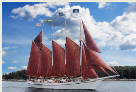
Fig. 24. The schooner Margaret Todd

There are ferryboat rides to other parts of Acadia Natl Park (e.g., to the isolated Isle du Haut from Stonington, ME aboard the mail boat, 207-367-5193). One can take the early evening ferry from Northeast Harbor to Little Cranberry Island (244-5582) and eat lobster at the Islesford Dock Res-