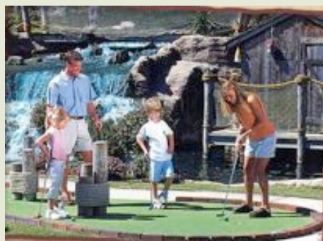
Fig. 26. Pirate's Cove Miniature Golf

Pirate's Cove Adventure Golf (Fig. 26) on Rte 3 between the entrance to the island and Bar Harbor. This is the best. Excellent minigolf. Two courses,