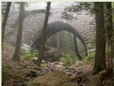
Fig. 14. The carriage trails are enhanced by many beautiful bridges, such as this one, seen from below that spans a stream

Even if you rent bring a bike rack if you've got one (can rent racks) to transport bikes from shop to trail. Note, however, that the Park runs a free bus service (Island Explorer Buses). The buses have bike racks on the front and back. They go all over the island (except near our house) and are a great service. Popular bike circle routes: