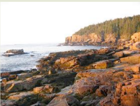
Fig. 5. Classic Maine coast along the Ocean Trail

small glacial lake) is definitely worthwhile, and I am a big proponent of also hiking Gorham mountain, which isn't hard and has great views (Fig. 4). The return trip along the Ocean Trail is also beautiful (Fig. 5).