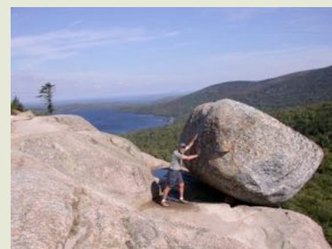
Fig. 8. Bubble Rock on top of the South Bubble mountain

Trail south from the parking lot → front face of the South Bubble → top of the Bubble and Bubble Rock → come down the back. Very short hike. Great view of Jordan Pond. Very steep exciting first section. The timid and young children can go up the back of the Bubble, directly from the parking lot. About 1 mile. The rock (Fig. 8) is a glacial remnant.