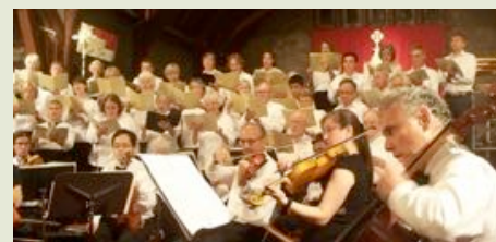
Fig. 27. Mount Desert Summer Chorale

outstanding chorus of summer visitors and full-time residents (Fig. 27). It performs major classical choral works, usually with orchestra, each year on the first or second Friday and Saturday in August. I sing with this group.