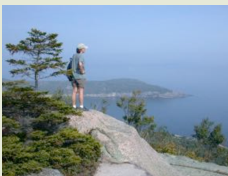
Fig. 4. View from Gorham mountain trail